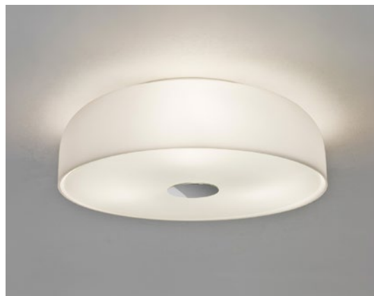
CODE: 1328001 FINISH: WHITE GLASS

TO MAINTAIN THIS PRODUCT TO ITS BEST CONDITION, PLEASE VIEW OUR CARE AND CLEANING GUIDE ON THE SUPPORT SECTION OF THE ASTRO WEBSITE.