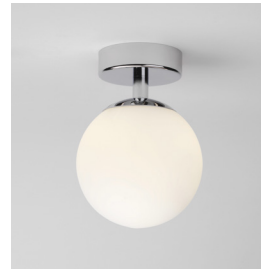
CODE: 1038001 FINISH: POLISHED CHROME