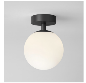
CODE: 1038005 FINISH: MATT BLACK

TO MAINTAIN THIS PRODUCT TO ITS BEST CONDITION, PLEASE VIEW OUR CARE AND CLEANING GUIDE ON THE SUPPORT SECTION OF THE ASTRO WEBSITE.