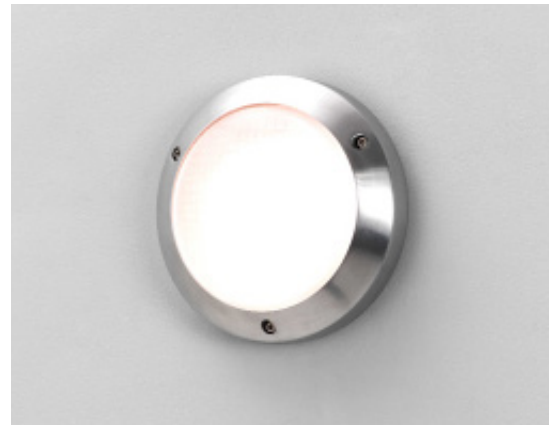
CODE: 1039005 FINISH: POLISHED ALUMINIUM

THIS PRODUCT IS NOT SUITABLE FOR INSTALLATION WITHIN FIVE MILES OF THE COAST. FOR THESE ENVIRONMENTS, PLEASE FILTER PRODUCTS ON THE ASTRO WEBSITE BY 'COASTAL'.