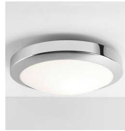
CODE: 1129001 FINISH: POLISHED CHROME