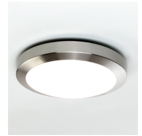
CODE: 1129005 FINISH: BRUSHED NICKEL

TO MAINTAIN THIS PRODUCT TO ITS BEST CONDITION, PLEASE VIEW OUR CARE AND CLEANING GUIDE ON THE SUPPORT SECTION OF THE ASTRO WEBSITE.