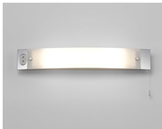
CODE: 1022001 FINISH: POLISHED CHROME

TO MAINTAIN THIS PRODUCT TO ITS BEST CONDITION, PLEASE VIEW OUR CARE AND CLEANING GUIDE ON THE SUPPORT SECTION OF THE ASTRO WEBSITE.