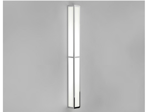
CODE: 1121066 (8419) FINISH: POLISHED CHROME

TO MAINTAIN THIS PRODUCT TO ITS BEST CONDITION, PLEASE VIEW OUR CARE AND CLEANING GUIDE ON THE SUPPORT SECTION OF THE ASTRO WEBSITE.