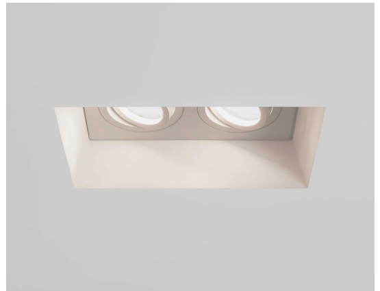
CODE: 1253006 FINISH: PLASTER

TO MAINTAIN THIS PRODUCT TO ITS BEST CONDITION, PLEASE VIEW OUR CARE AND CLEANING GUIDE ON THE SUPPORT SECTION OF THE ASTRO WEBSITE.