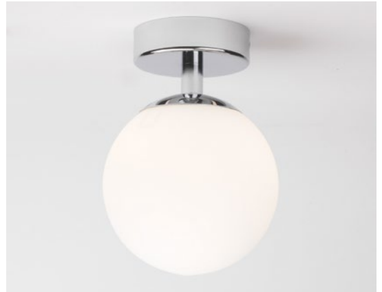
CODE: 1038001 FINISH: POLISHED CHROME

TO MAINTAIN THIS PRODUCT TO ITS BEST CONDITION, PLEASE VIEW OUR CARE AND CLEANING GUIDE ON THE SUPPORT SECTION OF THE ASTRO WEBSITE.