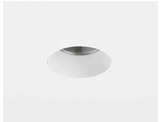
CODE: 1392011 FINISH: MATT WHITE

TO MAINTAIN THIS PRODUCT TO ITS BEST CONDITION, PLEASE VIEW OUR CARE AND CLEANING GUIDE ON THE SUPPORT SECTION OF THE ASTRO WEBSITE.